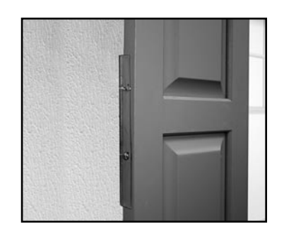
You have successfully side mounted a pair of shutters